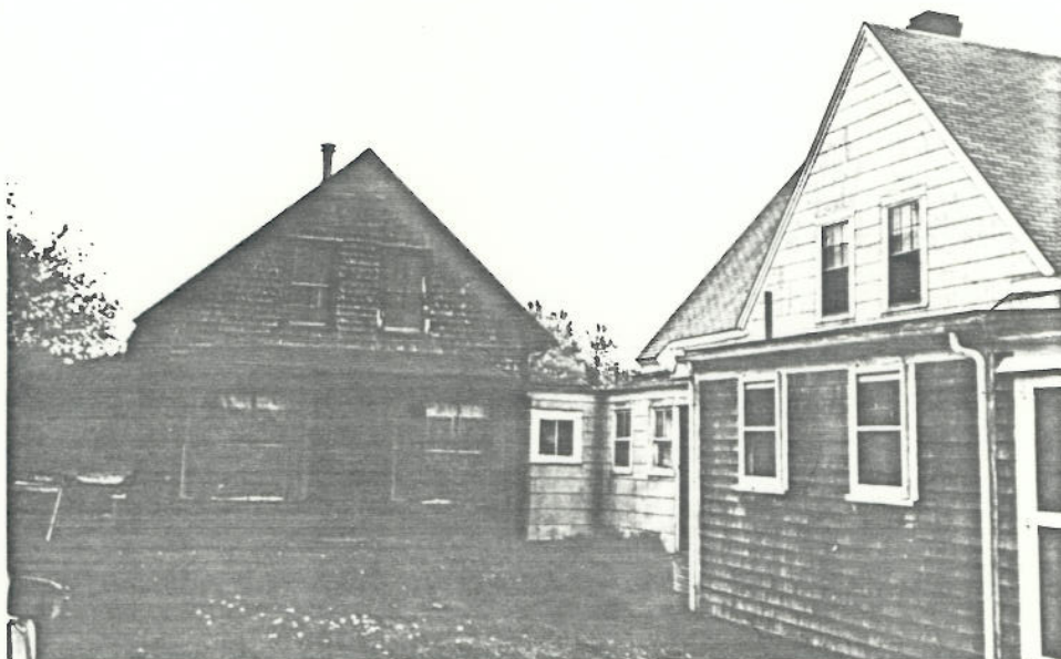
Staple to Inventory form at bottom