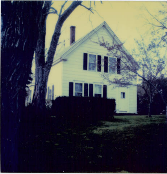
70 ROSA LANE - off River Road - Marston's Mills, MA.