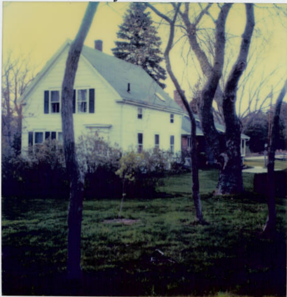
70 Rosa Lane - off River Road - Marston's Mills, MA.