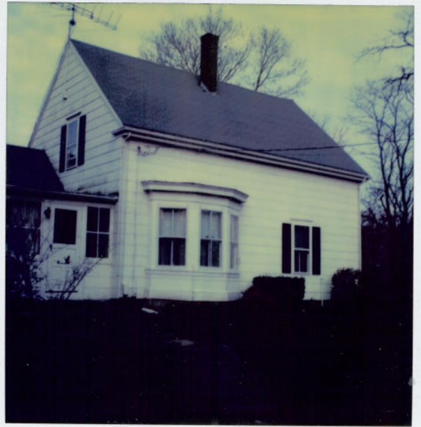
70 ROSA LANE off River Road - Marston's Mills, MA.