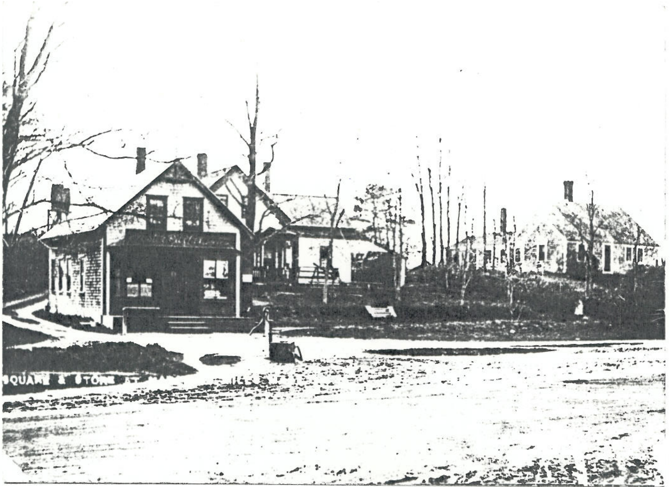
Square & Store at M.M. (7/6) before 1927 From Stetson Hall