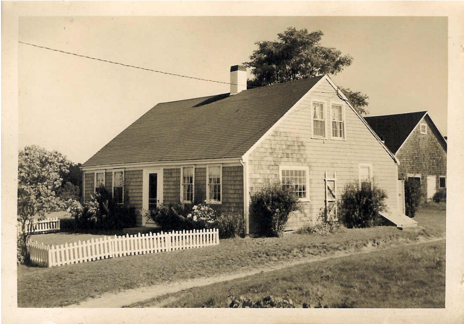
Picture taken in 1950's, exact date unknown.