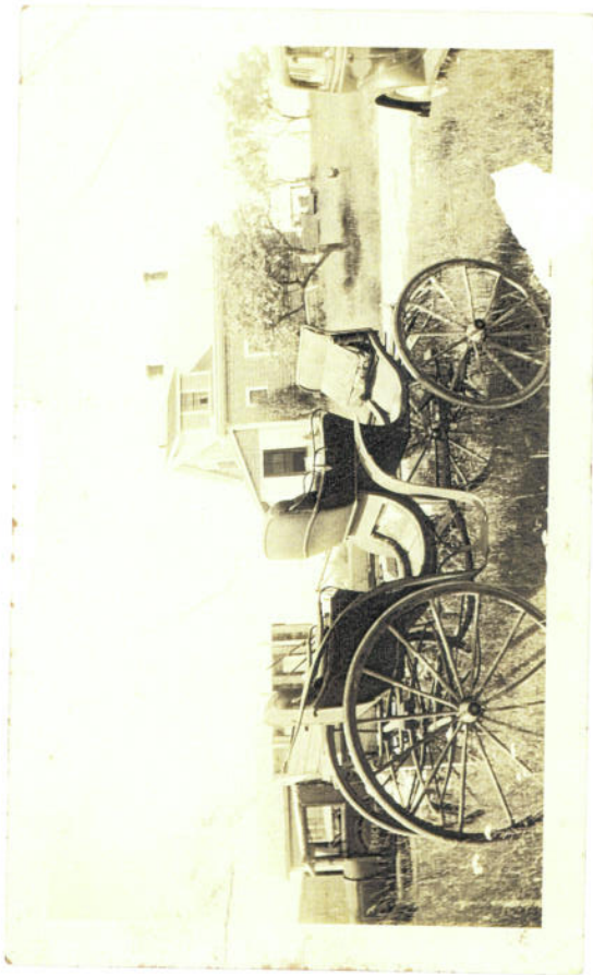
Hayden's "The Farm" from north c1937