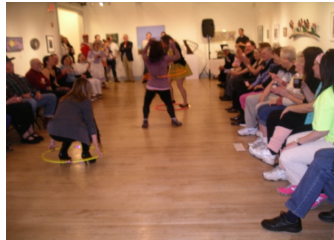
Hula Hoop hysteria !