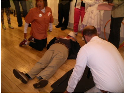
Was it the cranberries?