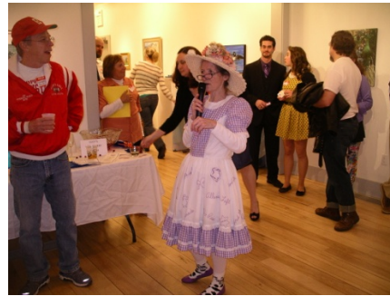
Minnie Pearl aka Renee Voorhees shouts out “Howdy” and Who done it?