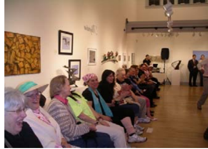
They are all suspects.