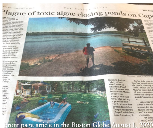
Front page article in the Boston Globe August 1, 2020

next generation technology. There is an EPA research project in the works to guide a Shubael Pond project to understand the ground water flow into the 53-acre kettle pond in the Sand Shores neighborhood. You can check them out at the Massachusetts Alternative Septic System Test Center. In a nutshell, the I/A system uses wood chips—a natural filtering system—installed in a unit connected to an existing septic system. The Barnstable Clean Water Coalition is on a mission. Hope springs eternal.