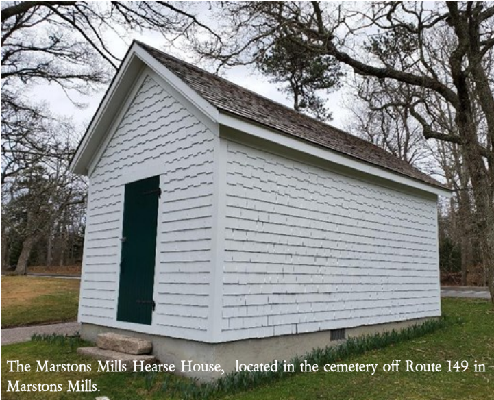
The Marstons Mills Hearse House, located in the cemetery off Route 149 in Marstons Mills.