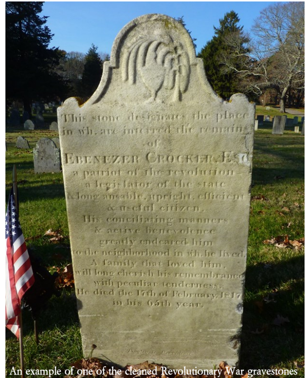
An example of one of the cleaned Revolutionary War gravestones

In collaboration with the Cape Cod Chapter of the Sons of the American Revolution (SAR), the Society will hold a special commemorative ceremony on Saturday, October 10, 2020 in the Cemetery, with a rain date of Saturday, October 24. Starting at 10:00 a.m., the outdoor ceremony will include prayers, narratives of the Revolutionary War service of each of the twelve Patriots, the marking of each grave with a special SAR medallion and an American flag placed by a living descendant in each case, a bugler playing Taps and a musket volley by a Color Guard from the Yarmouth Minute-Men (a Revolutionary War re-enactment group who will be dressed in period uniforms). The event is free; all attendees are asked to wear appropriate masks, bring a folding chair and observe appropriate social-distancing. Parking will be along the sides of either of the entrance roads to the Cemetery. Light refreshments will be served after the ceremony at Liberty Hall. Special guests expected to be present are both of our State Representatives, the President of the Barnstable Town Council, and one of our representatives to the Town Council.