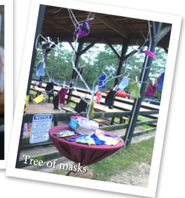
Tree of masks

As 2020 roared on, ponds were off limits for swimming and polluted with bacteria. Enter the Barnstable Clean Water Coalition team to do something. Ever hear of an I/A, aka Innovative and Alternative, septic system? It is