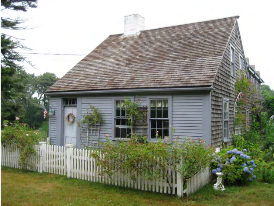
Southwest and partial southeast elevations