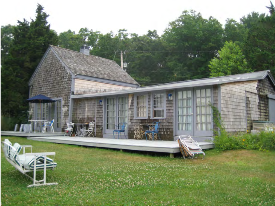
Barn, northeast elevation