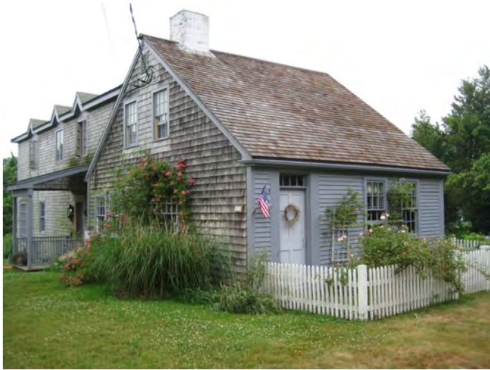
Northwest and southwest elevations