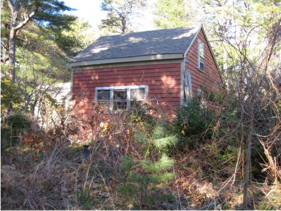
744 Old Falmouth Road, Southwest End