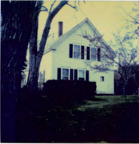
70 ROSA LANE - off River Road - Marston's Mills, MA.