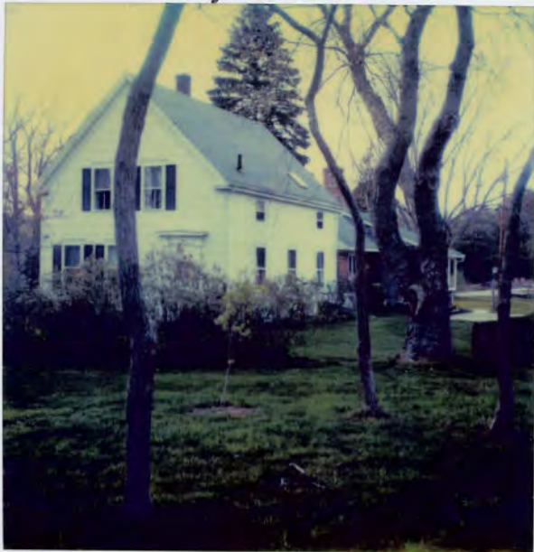
70 Rosa Lane - off River Road - Marston's Mills, MA.