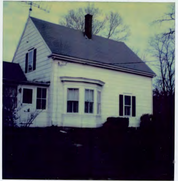
70 ROSA LANE off River Road - Marston's Mills, MA.