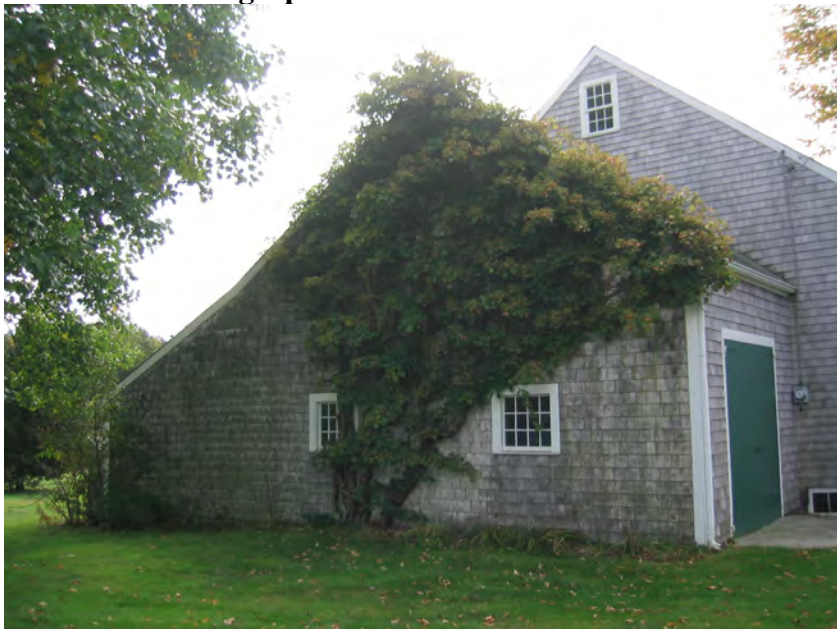
Northeast side showing addition with shed roof at rear