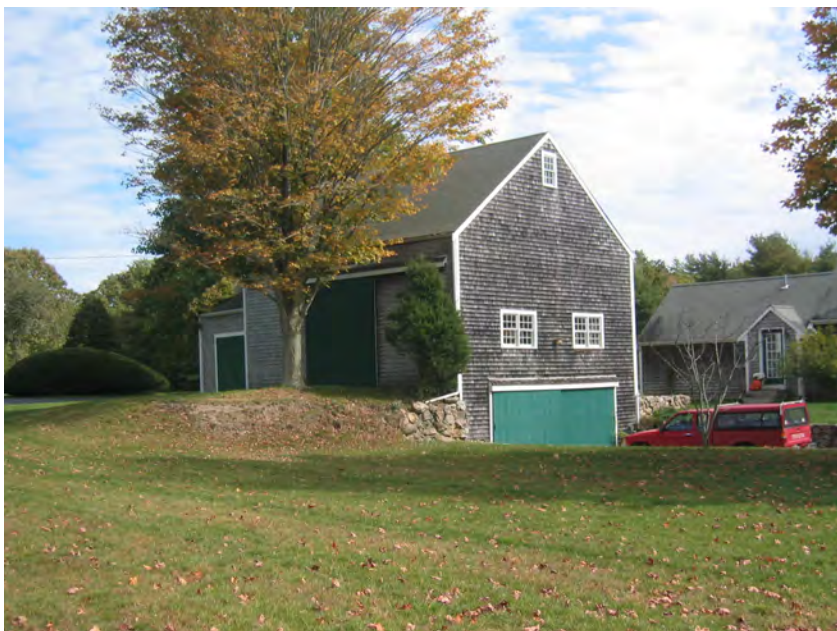
Southwest side showing cellar doors